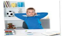
4. finish my homework ☆