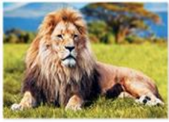
1. lion ☆