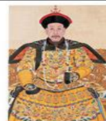
15. emperor ☆