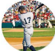
2. play baseball ☆