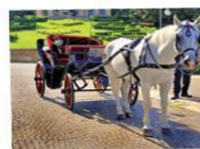
11. carriage ☆