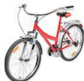
10. bicycle ☆