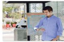
2. wait ☆