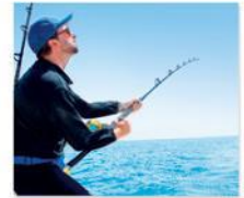
4. go fishing ☆