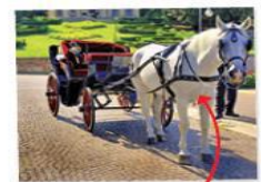
12. horse ☆