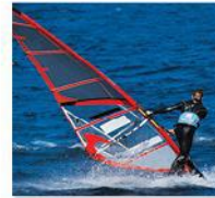
3. go windsurfing ☆