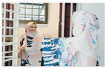
1. visit ☆