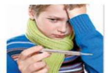
16. sick ☆