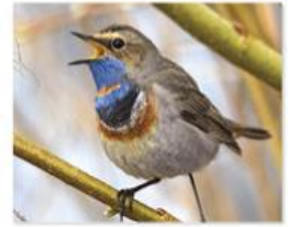
4. nightingale ☆