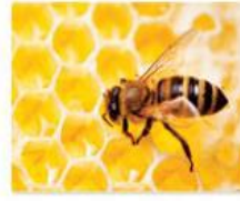
3. bee ☆