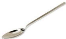
9. spoon ☆