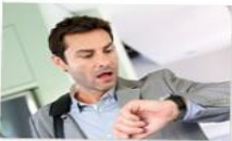
5. late ☆