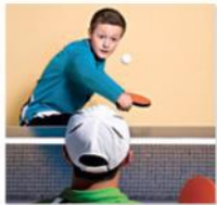
1. play table tennis ☆