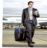
3. arrive ☆