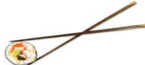
7. chopsticks ☆