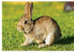
2. rabbit ☆